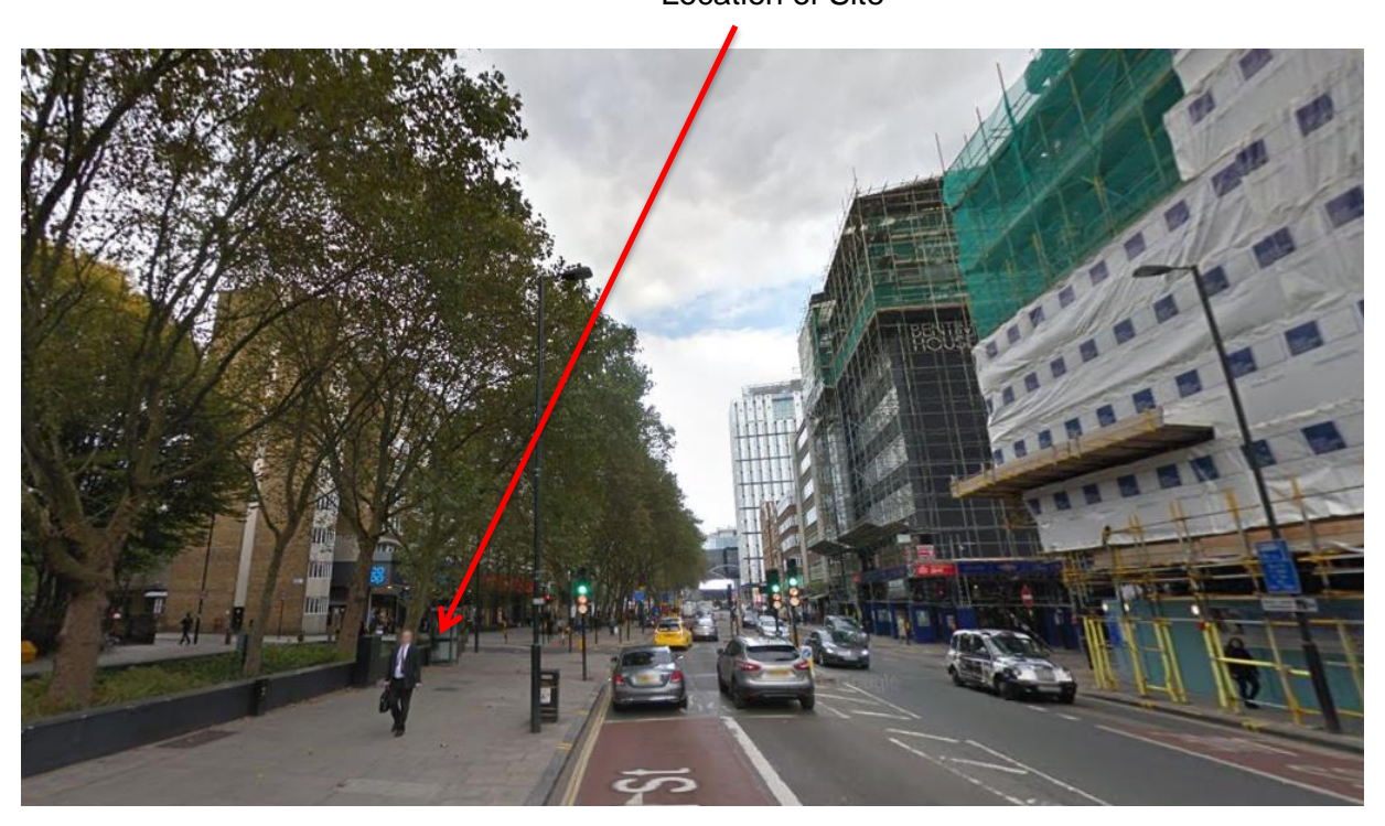
Image 2: View of existing BT phone box looking east along Old Street towards Old Street roundabout