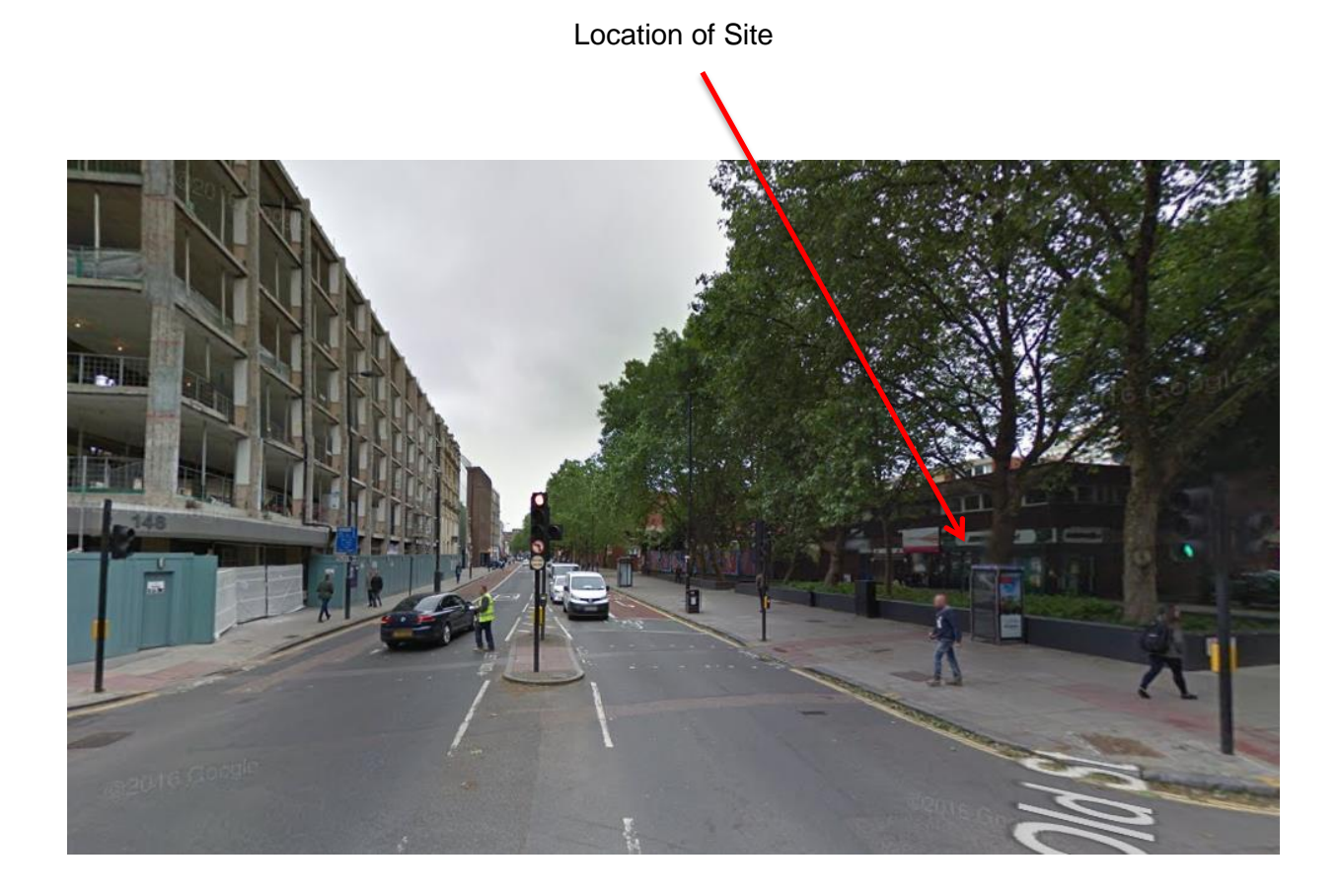
Image 3: View of existing BT phone box looking west along Old Street towards St Lukes Close